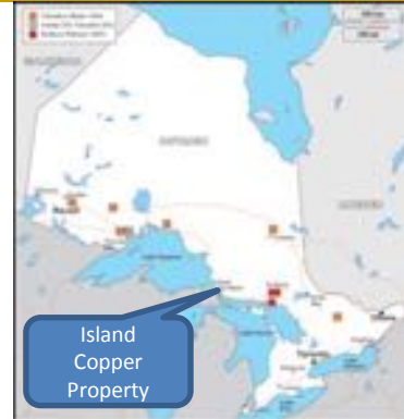
Island Copper Property